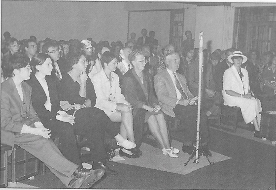
At the O'Malley Mass UCG Chapel, June 1997

Chatting with the Americans and Australians and theirs was a significant presence (78 overseas) the feeling is, that now that The Clan is on the Internet, that there is a great possibility for growth of