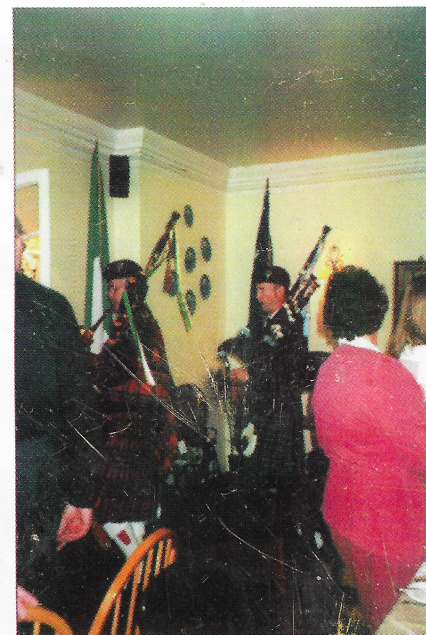
Pipes, Rally 2001